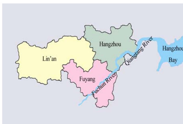
Fig.1 Geographic instruction

We chose an ecosphere in the south, west, north, east and center of the study area as shown in Fig.1 and collected samples including water from ditches, lakes, rivers, well water, tap and superficial soil. The research team members were mainly from the Department of Endocrinology of Sir Run Run Shaw Hospital, and received unified training to guarantee the quality control. All the sampling bottles were soaked in diluted hydrochloric acid, cleaned and heated dry.