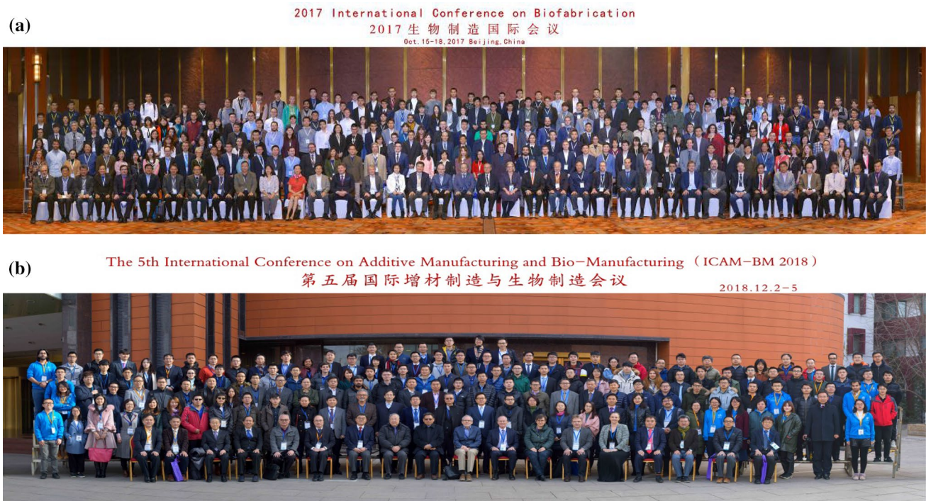
Fig. 4 The most recent international conferences organized by the Center: a 2017 International Conference on Biofabrication, October 15–18, 2017, Beijing, China; b The 5th International Conference on

The vision of the Bio-manufacturing Center at Tsinghua University is aimed toward establishing a leading research center for the conducting cutting-edge research, education, and innovation within the emerging and interdisciplinary field of Bio-manufacturing. As mentioned previously, the group’s focus will be highly directed toward research on engineering living system and human-like micro-physiological systems, exploring a new paradigm of modern engineering and manufacturing for innovative applications in bioengineering and health sciences, biology and biomedicine, and promoting the development of the field of advanced bio-manufacturing. With excellent faculty members, postdocs, graduate students, facilities, and international collaborations to our disposal, our group is eager to further help progress innovative and future developments within the field.