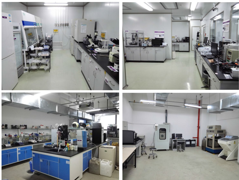
Fig. 3 Photographs of laboratory space and facilities

The Center in Beijing has world-class bio-3D printing and cell assembly equipment, dedicated control software, and three-dimensional data reconstruction software, as well as standard 1000-class and 10,000-class clean room required for cell culture and printing experiments. In addition, the Center is also equipped with facilities for cell culture, biological testing and evaluation, and scaffold and bioink characterization and evaluation. This includes several cell culture incubators, centrifuges, fluorescent microscopes, laser confocal microscopes, microplate readers, flow cytometry systems, biomaterials mechanical property testing machines, rheometers, quantitative PCR systems, and much more (Fig. 3).