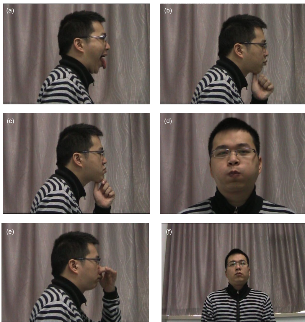
Fig. 1 Patients' exercising method

(a) Open mouth and stretch tongue ten times every day and night; (b) Use the thumb pad to massage the submental area for one minute every day; (c) Use thumb to push the chin forward and upward ten times every day; (d) Blow out the cheeks ten times a day for at least five seconds each time; (e) Hold the nose, close the mouth, and blow (Valsalva maneuver) ten times a day for at least five seconds each time; (f) Close the mouth, inhale and exhale slowly and deeply through the nose 20 times every night